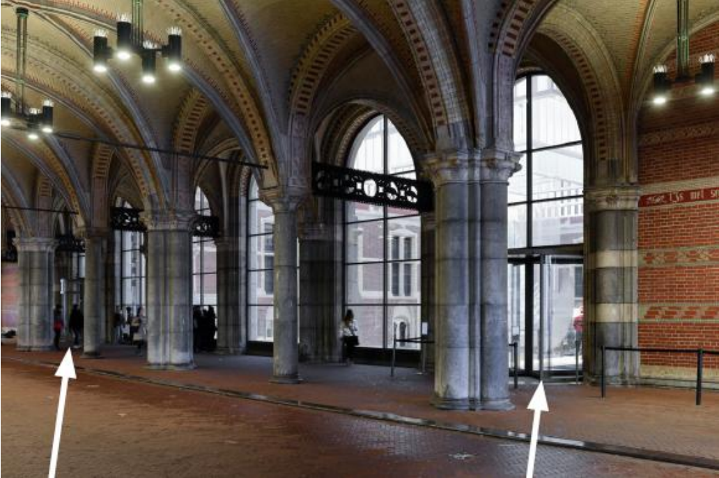
ENTRANCE WITH STAIRS

In the middle is the bike path, and on the sides are the sidewalks. People often cycle through the tunnel, and sometimes musicians play music there. In this tunnel, you'll also find the museum's entrances. There are four in total: three doors that lead to a staircase and one entrance with an elevator.